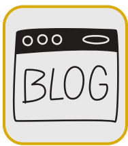
Blogs or Websites