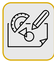
Online Collaborative Projects